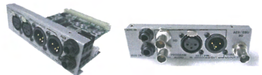
Choose from Analogue or Digital inputs

In demanding broadcast environments use Tieline's unrivalled software programming flexibility to auto-reconnect and failover to backup connections over your choice of connection transport in demanding broadcast environments.