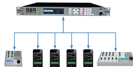
Merlin PLUS connecting 6 remotes simultaneously

The codec includes the low delay and cascade-resilient E-apt-X algorithm, as well as other popular algorithms including the full AAC suite, variable bit-rate Opus, MPEG Layer II, MP3, Tieline Music and MusicPLUS, G.722 and G.711. Asymmetric [2] encoding and decoding lets you send high quality audio in one direction and save on data by sending low bandwidth program on the return path.