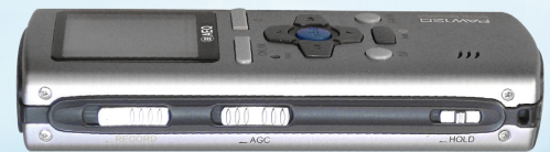
Recorder AGC Hold