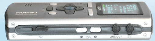
USB port + vol - Line out Headphones