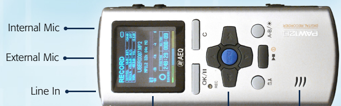
Internal Mic External Mic Line In Color Display Control Menu Speaker